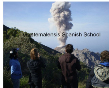
Santiaguito (active crater)

Authorized, Certified and Professional staff and guides.