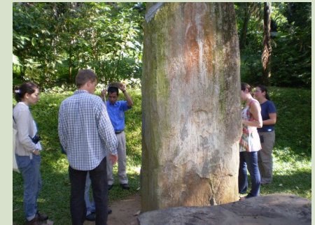
Takalik Abaj (mayan archeological site)

Learn the Spanish language with us and get more benefits for you!.