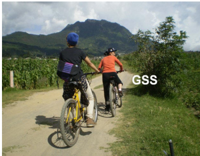
Biking in the Highland.

Please visit our website to know more about our programs.